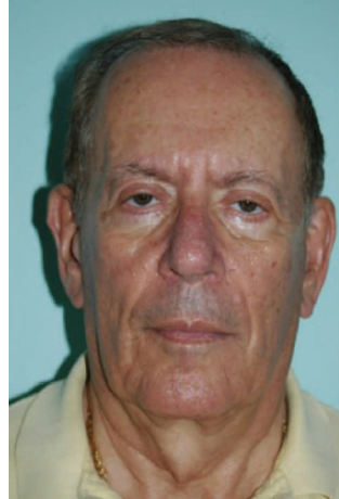
October 1, 2009 before ageLOC