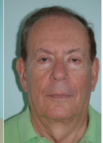
January 19, 2010 after using ageLOC